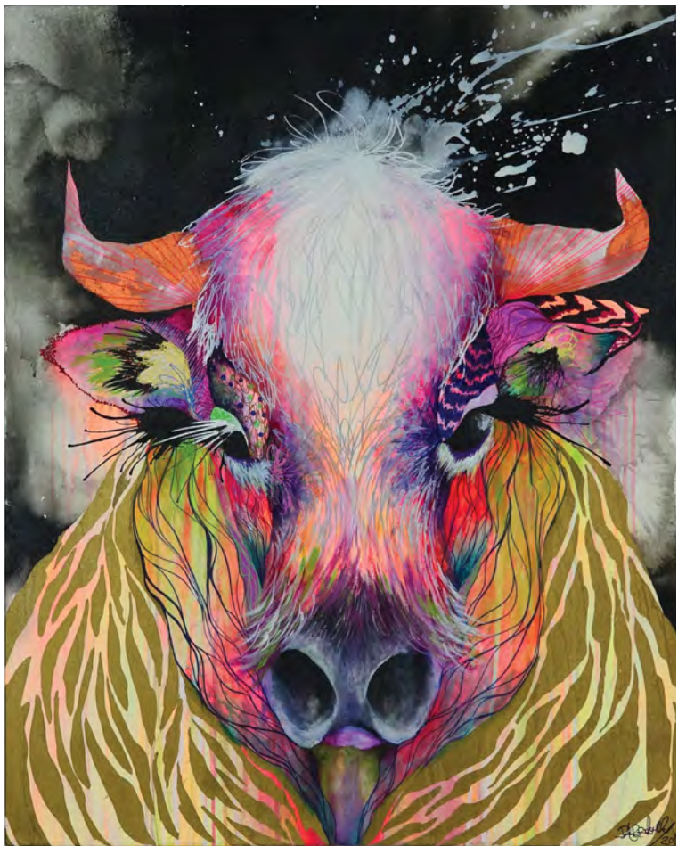
El Billy Mixed Media on Canvas 39" x 31.5"