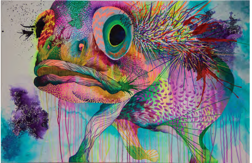
Pepe Coral Mixed Media on Canvas 24" x 36"