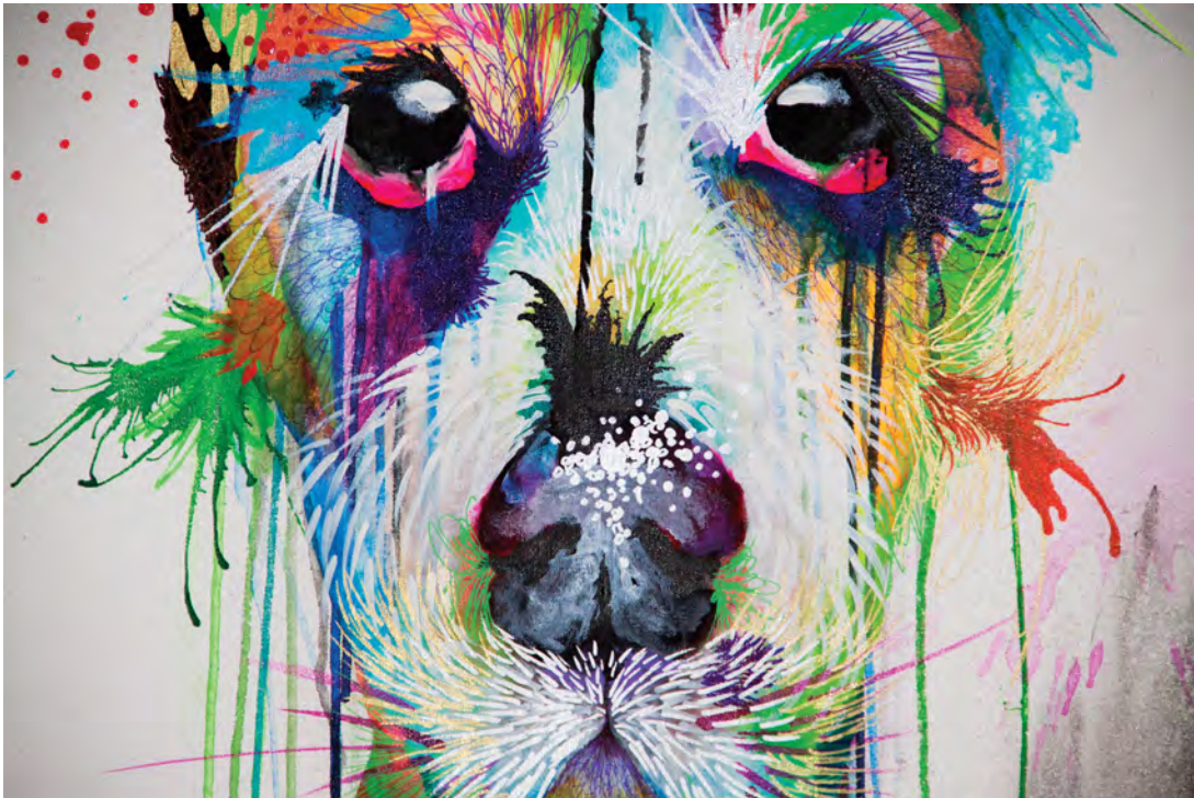
Cansancio tus ojos Mixed Media on Canvas 47.5" x 20"