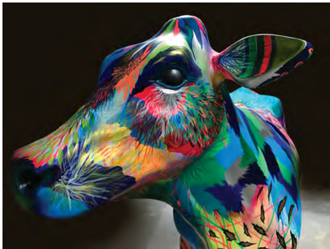
Don Gastón Automotive paint on fiberglass 64" x 84" x 26"