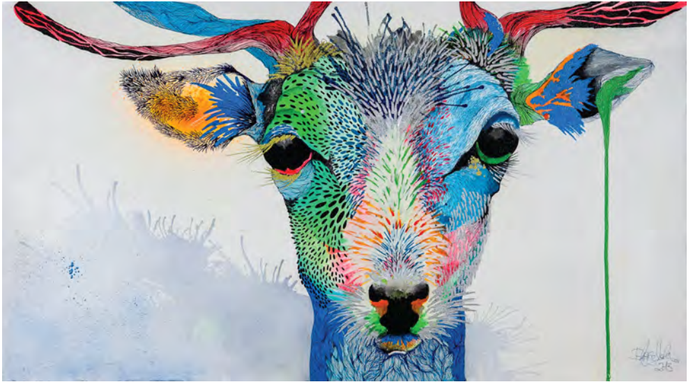
Albino Mixed Media on Canvas 35.5" x 20"