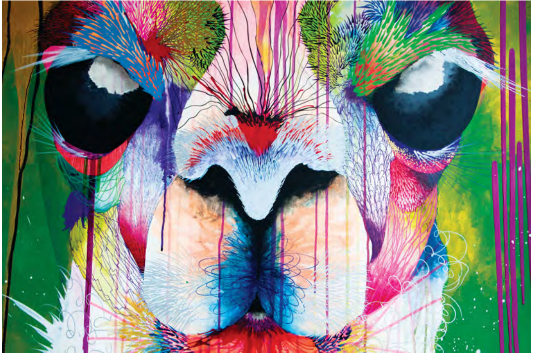
Llama Ñañita Mixed Media on Canvas 79" x 39"