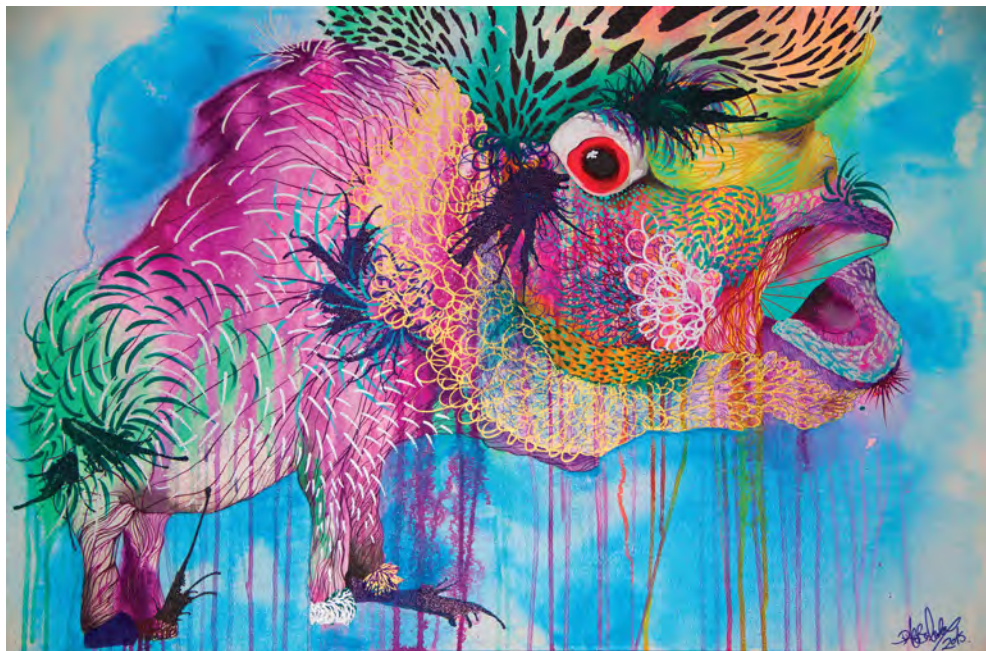
Rosa Inflada Mixed Media on Canvas 24" x 36"