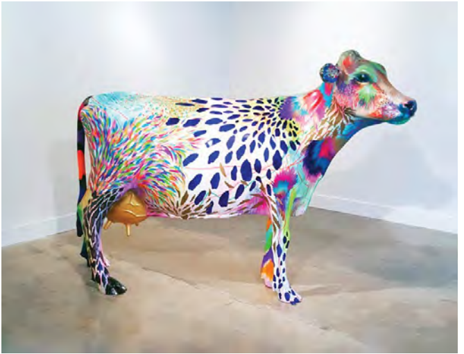
Doña Norma Automotive paint on fiberglass 64" x 84" x 26"