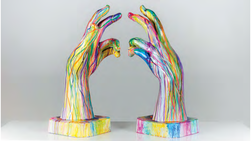
Plastic Universe Automotive paint on fiberglass