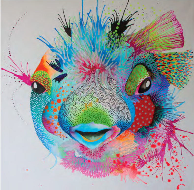
Cherry Blow Mixed Media on Canvas 35.5" x 23.5"