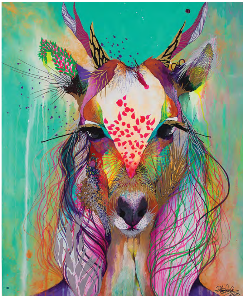
Clementina Mixed Media on Canvas 39" x 31.5"