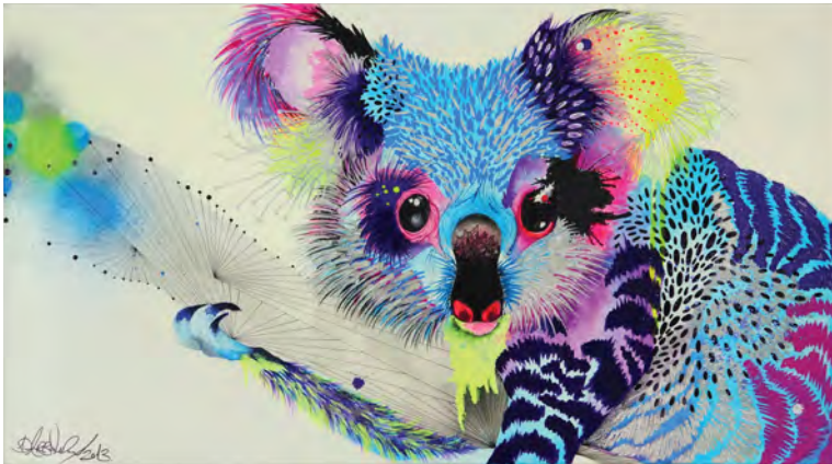
Max Koala Mixed Media on Canvas 35.5" x 20"