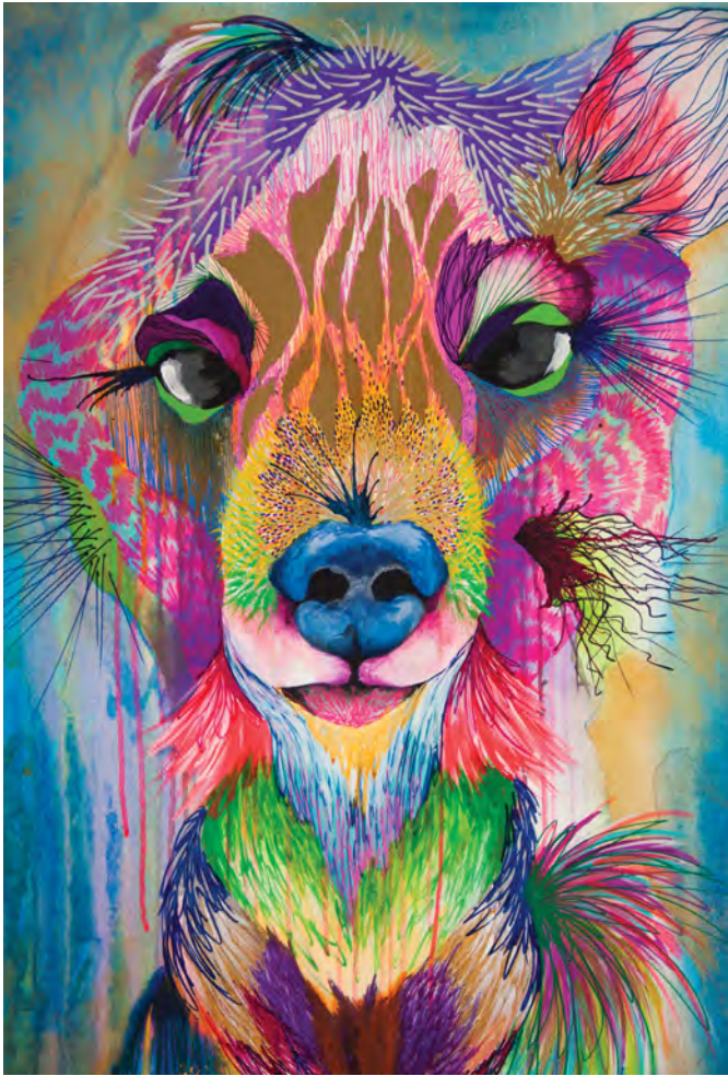
Blanca Elena Mixed Media on Canvas 39" x 31.5"