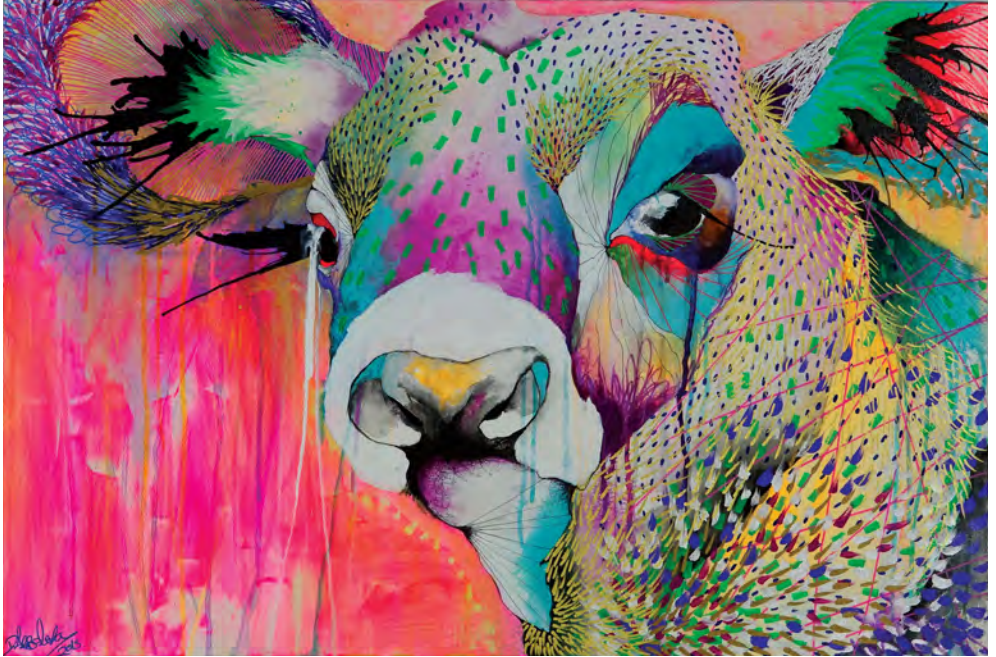
Torettilo Expectante Mixed Media on Canvas 35.5" x 23.5"