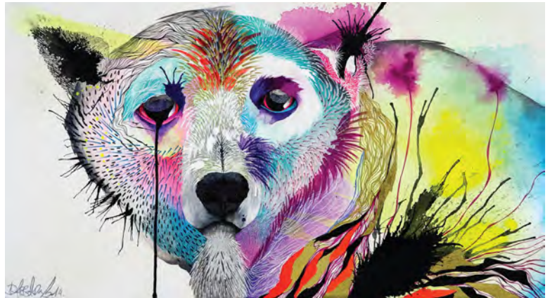
Ruco Polar Mixed Media on Canvas 35.5" x 20"